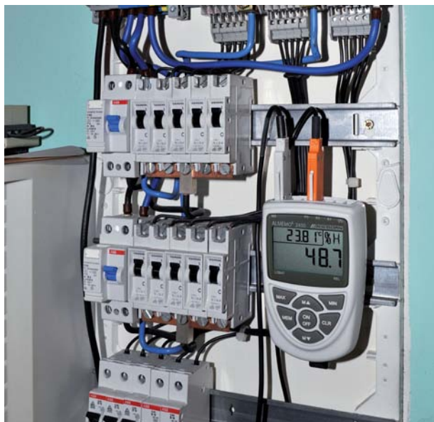
Programming analog output (example)